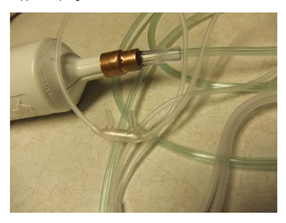
Here's the Nasal Cannula in the picture above: http://www.amazon.com/gp/product/B00881RIOE/ref=oh aui detailpage o03 s00?ie=UTF8&psc=1

For using a Nasal Cannula, attach the wide end of the tubing of the cannula (very short piece) to the copper coupling / structured water unit: